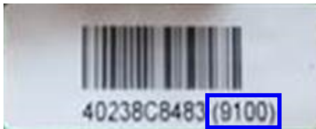
Figure 3-1 Device ID in decimal code