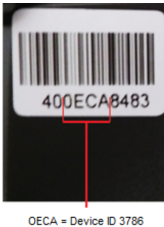
Figure 3-2 Device ID in hexadecimal code