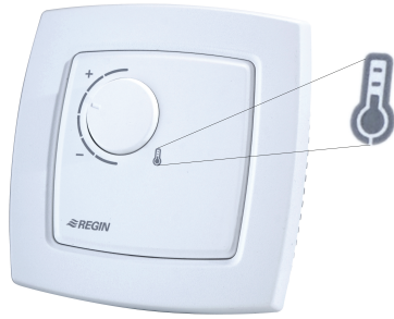
Fig. 1 Temperature indication

The controller has a LED shaped as a thermometer on its front. A red light indicates heating control is active and a blue light indicates active cooling control. If the LED is switched off, it means neither heating or cooling control is active.