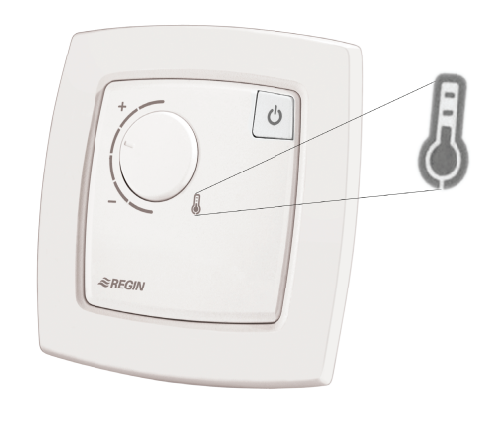
Fig. 2 Temperature indication

The controller has a LED shaped as a thermometer on its front. A red light indicates heating control is active and a blue light indicates active cooling control. If the LED is switched off, it means neither heating or cooling control is active.