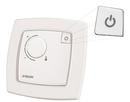
Fig. 1 Occupancy button