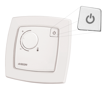
Fig. 1 Occupancy button