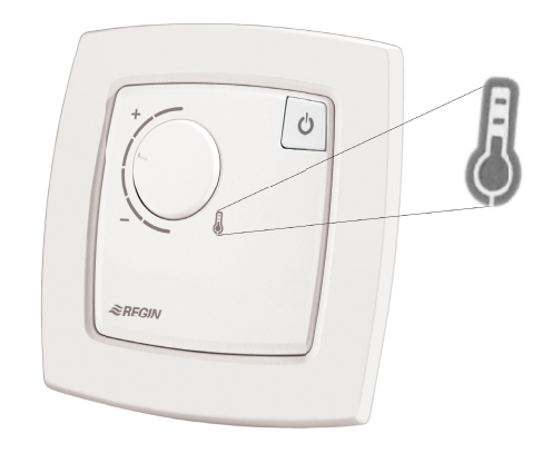
Fig. 2 Temperature indication

The controller has a LED shaped as a thermometer on its front. A red light indicates heating control is active and a blue light indicates active cooling control. If the LED is switched off, it means neither heating or cooling control is active.