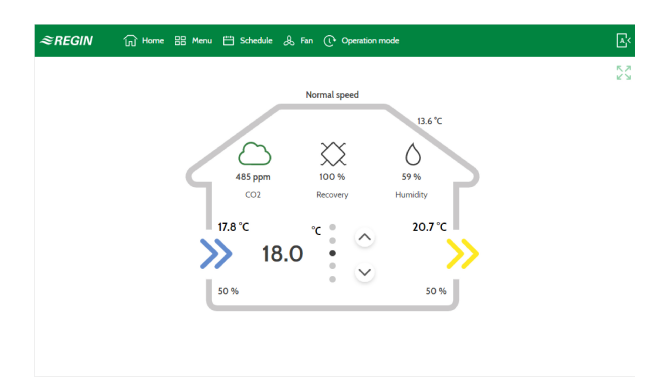
Fig. 1 Start page web interface